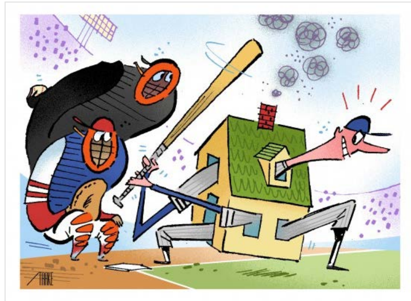
Well, that's one way to make every game a home game on Opening Day — one "druthers" idea for our new contest, Week 1068. (See below this week's results.)