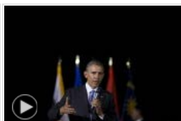
In Malaysia, Obama calls for unity on Russia