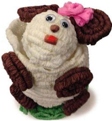
(Pat Myers) - You wouldn't want to mar your elegant bathroom decor with a visible roll of extra toilet paper! Much better to hide it in this week's second prize.