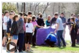
Students mourn classmate stabbed hours before prom